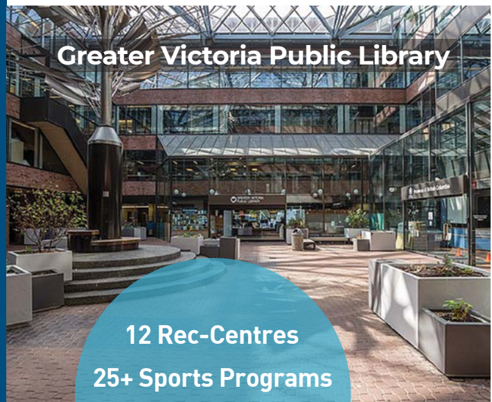
Greater Victoria Public Library

Fine Arts: Local studios offers opportunities for students to experience multiple forms of art such as painting, collage, hand building clay, silk screening, printmaking, pottery and watercolors, etc.