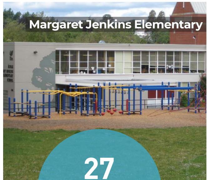
Margaret Jenkins Elementary