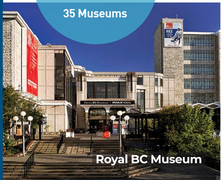
Royal BC Museum

12 Rec-Centres 25+ Sports Programs 200+ Restaurants 35 Museums